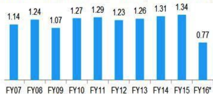
Production of man-made fibre (million tonnes)